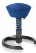
CLASSIC: Anthracite base