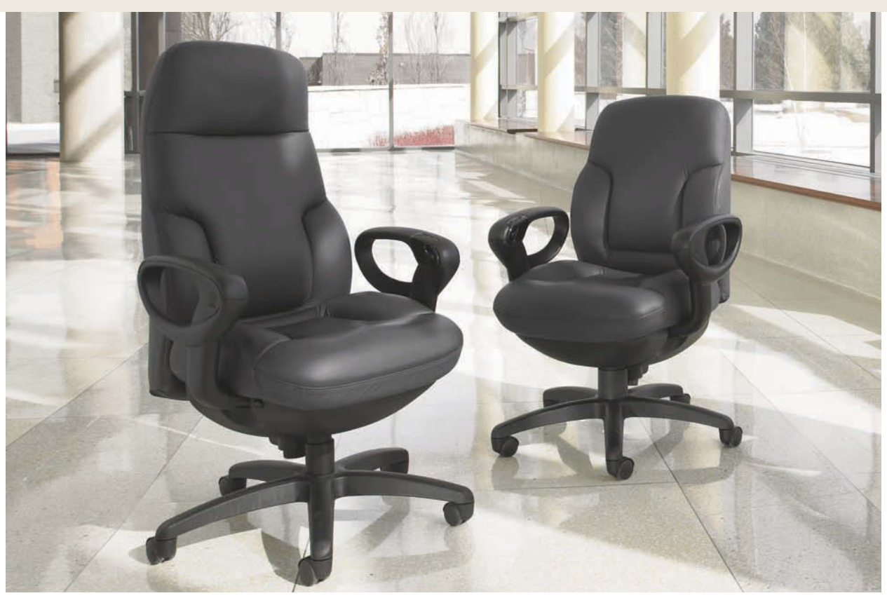
Shown left to right: 2424 Executive 24-HR High Back Synchro-Tilter and 2425 Executive 24-HR Medium Back Synchro-Tilter in Contract Leather Black (D534, Grade 12)