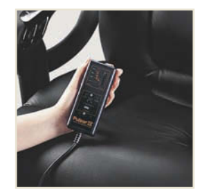
Control Wand A control wand with on/off control allows specific adjustment of the massage type, location and intensity.