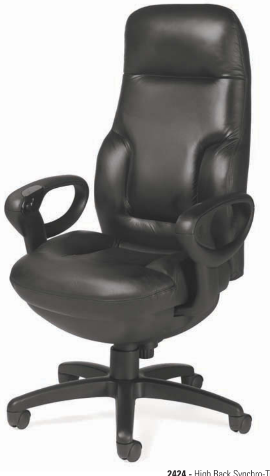
2424 - High Back Synchro-Tilter in Black Leather (D534)