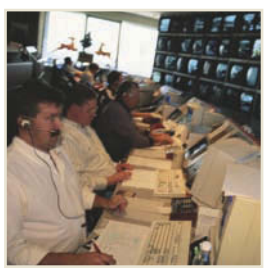
Air Traffic Control + Transportation Monitoring Aircrafts arrive and depart, shifts follow each other around the clock, and Concorde 24-HR is there to meet the challenge.