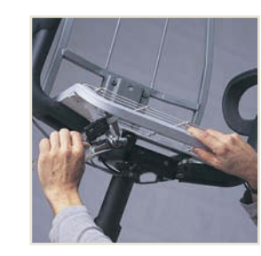
Engineering Concorde 24-HR Chair has four utility patents related to buttoncontrolled operation and several design registrations pending.