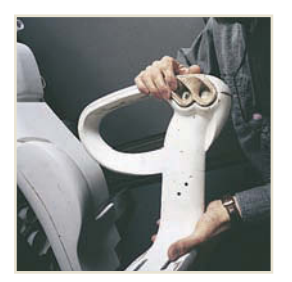
Tooling Global invests heavily in highprecision tooling to maximize efficiencies, ensure rigid quality control and reduce product costs for its customers.