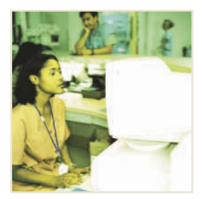
Health Care Institutions Concorde 24-HR works to keep caregivers comfortable, alert and ready for any emergency.