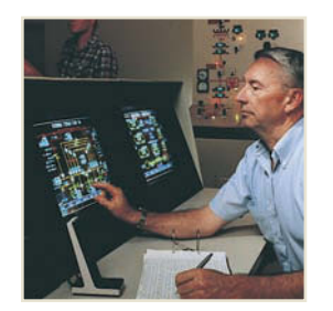
Utilities Control Room and Process Manufacturing Facilities deliver power nonstop; Concorde 24-HR delivers push button comfort for a lifetime-guaranteed by Global.