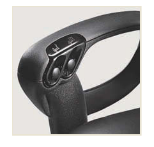
Control Buttons These turn the massage function on or off. LED lights in the chair arm indicate which massage motors are in use.