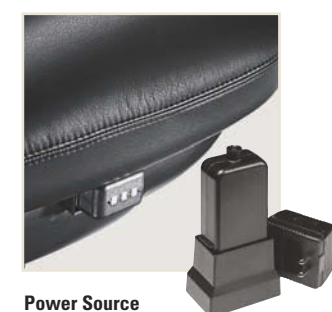
Rechargeable battery slides into the built-in, under seat pocket (AC charger also included).